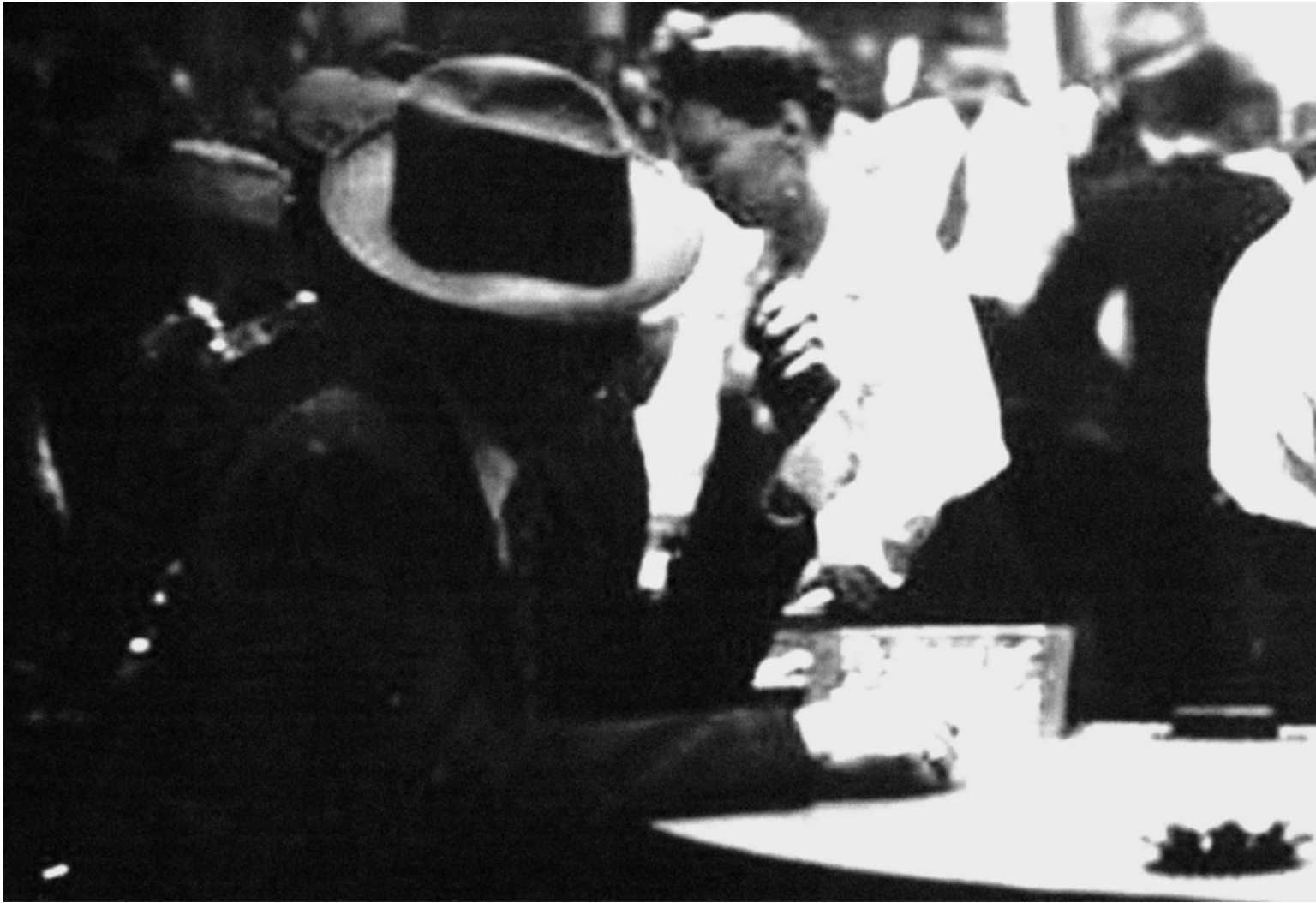
The Blackjack table at a Reno casino. 1944