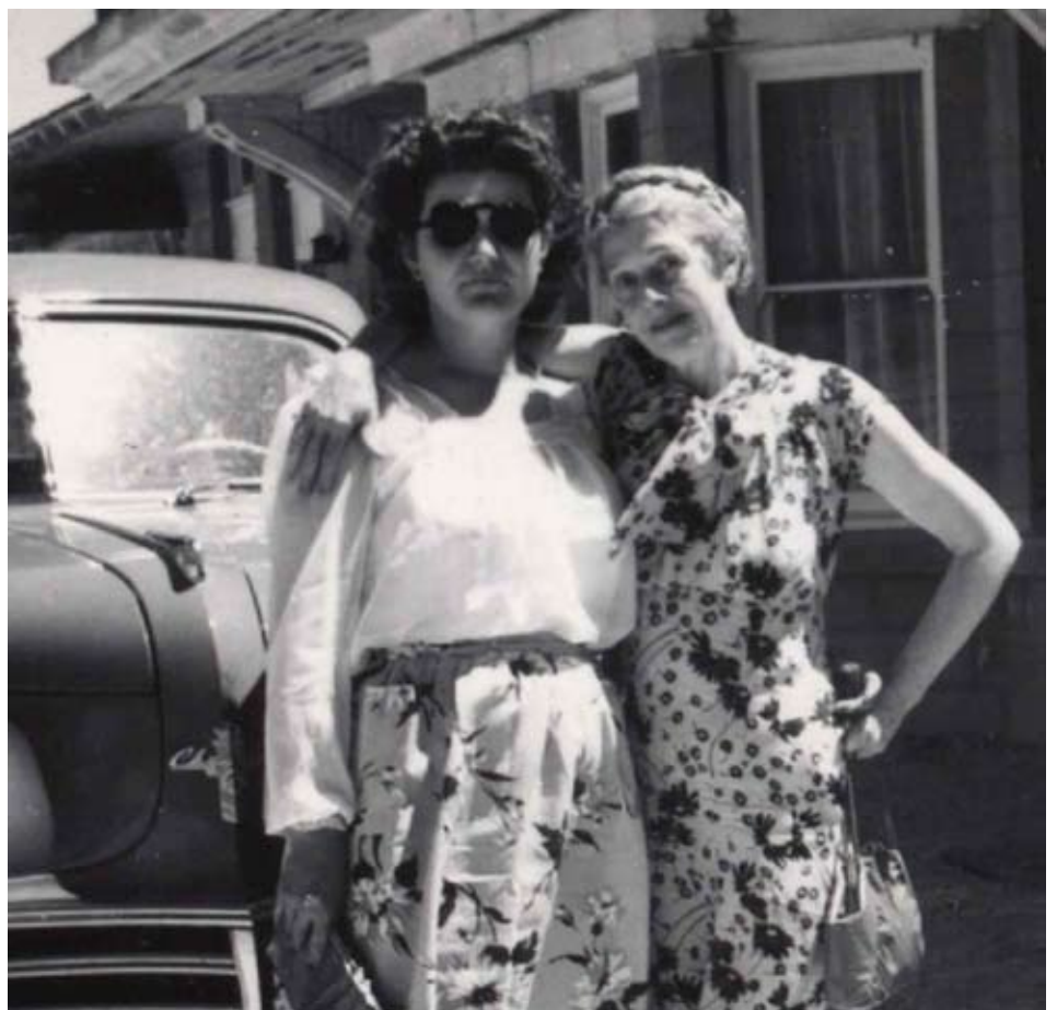
Two "Ladies of the Evening" at the Rhyolite Casino